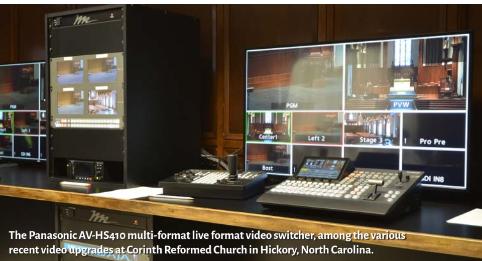
The Panasonic AV-HS410 multi-format live format video switcher, among the various recent video upgrades at Corinth Reformed Church in Hickory, North Carolina.

Beyond the sound improvement in the sanctuary, the church also blended the speakers visually into the space. “If I ask (a congregant) from the back of the space, to tell me where (the new speakers are), they can't tell me, as they are inconspicuous, and we cut the number of speakers by half or more.” WF