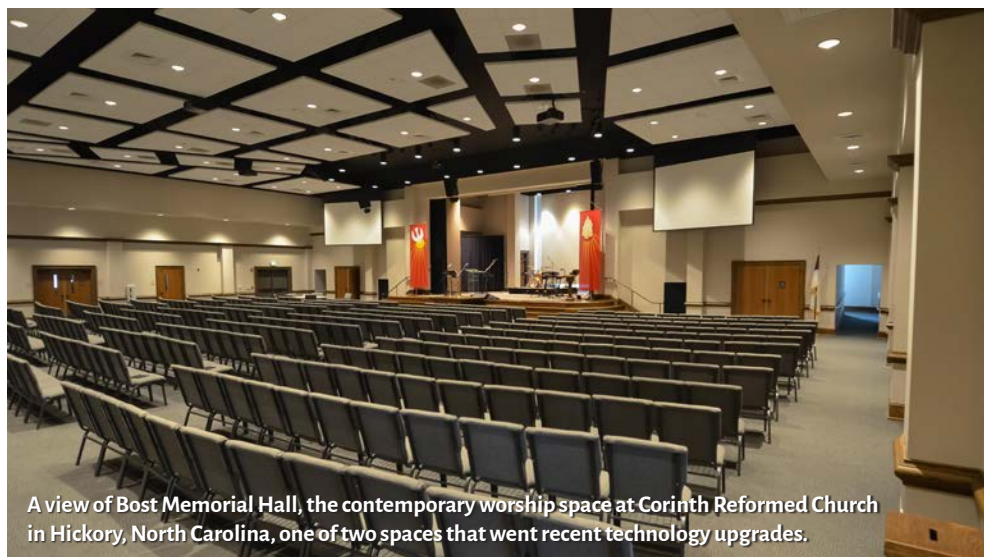
A view of Bost Memorial Hall, the contemporary worship space at Corinth Reformed Church in Hickory, North Carolina, one of two spaces that went recent technology upgrades.